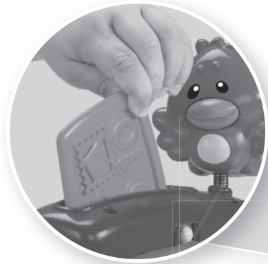
Drop letters into the slot