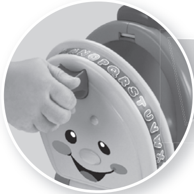
Open and close the postbox