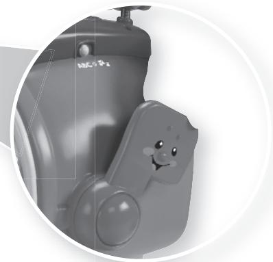
Lift and lower the flag