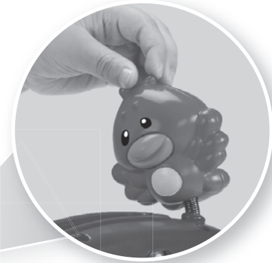
Bat the bird